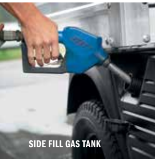
SIDE FILL GAS TANK