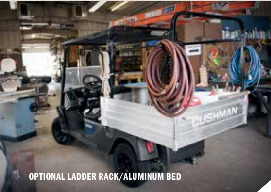
OPTIONAL LADDER RACK/ALUMINUM BED