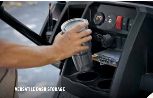
VERSATILE DASH STORAGE